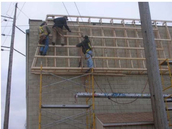
Workers install framing for the new façade.