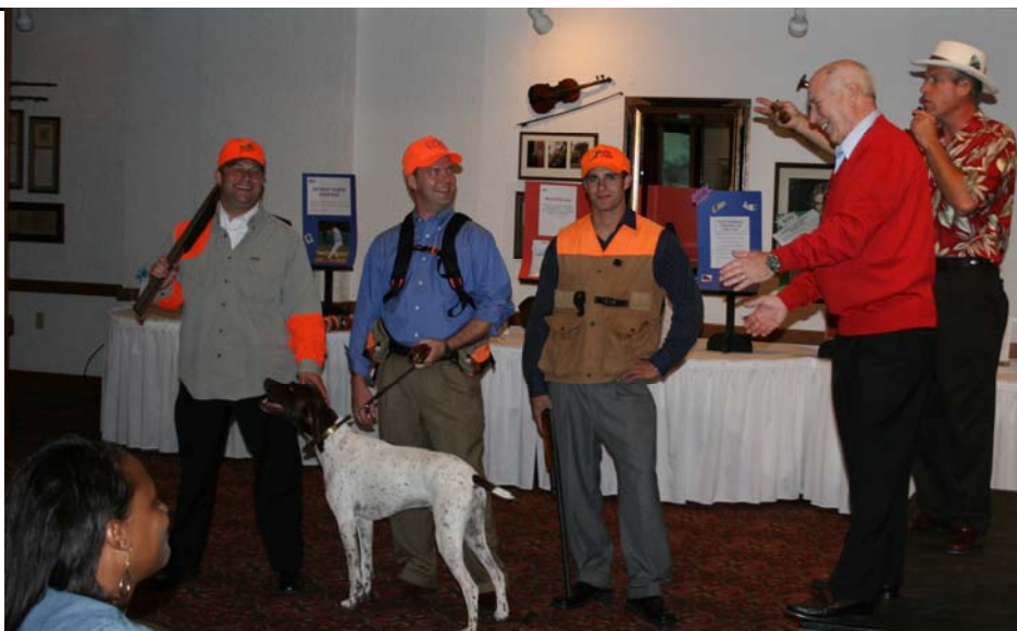
Three hunters and their dog await a successful bidder for their quest .

lunch, chukar hunt in the afternoon; all we met the goals we had for the event in Frankenmuth. this year."