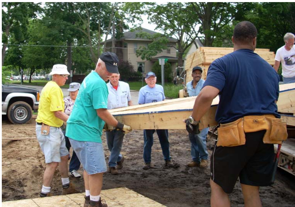
Enthusiastic volunteers unload walls at the "Alphabet Soup" House on Harrison. CWU, AACU, and ELCA, LCMS churches are participating.