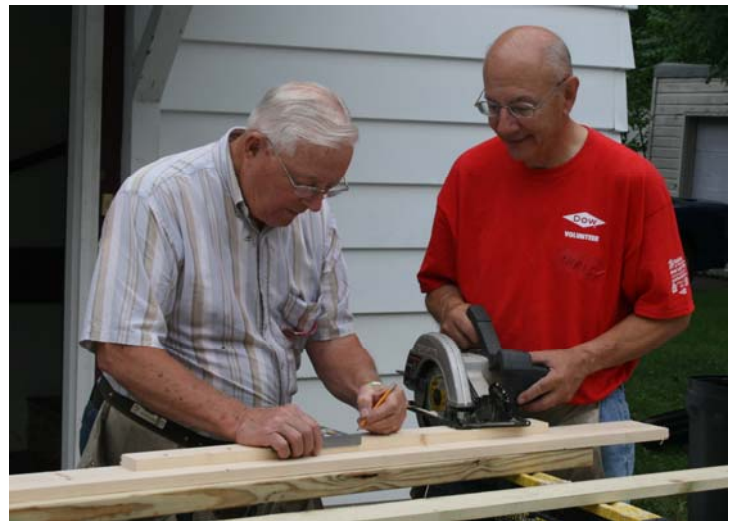
St. Lorenz Lutheran Church volunteers installed windows and doors.