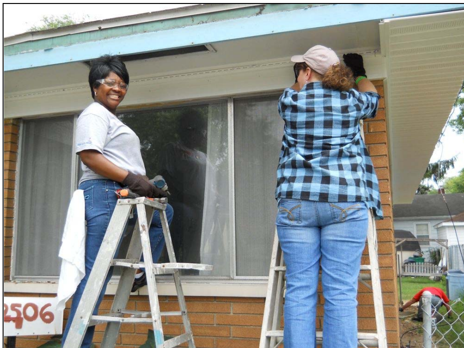
Consumers Energy employees replace windows, soffits, fascia & more!

Both grants were matched by the Saginaw, Bay Area, and Midland Community Foundations and The Dow Chemical Company.