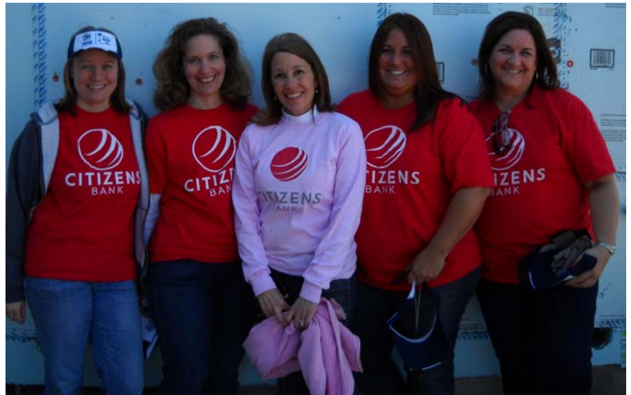
Citizens Bank employees volunteered for Women Build this past May

We thank all donors, for without financial resources this ministry wouldn't exist. It takes the talent and treasure of many for the miracle that is Saginaw Habitat for Humanity. Thank you for making it happen.