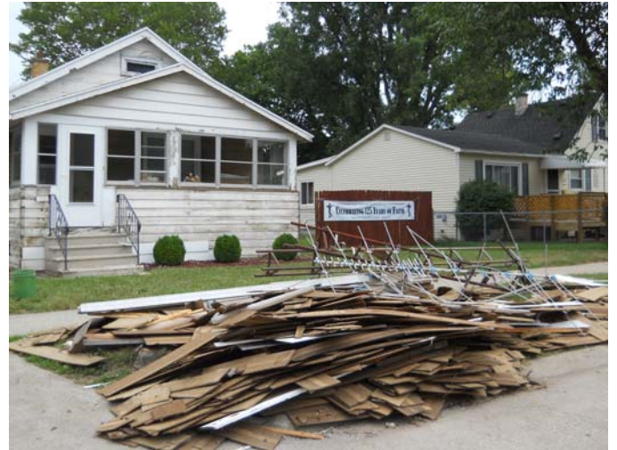
One of the houses is prepared for new siding, windows and insulation.