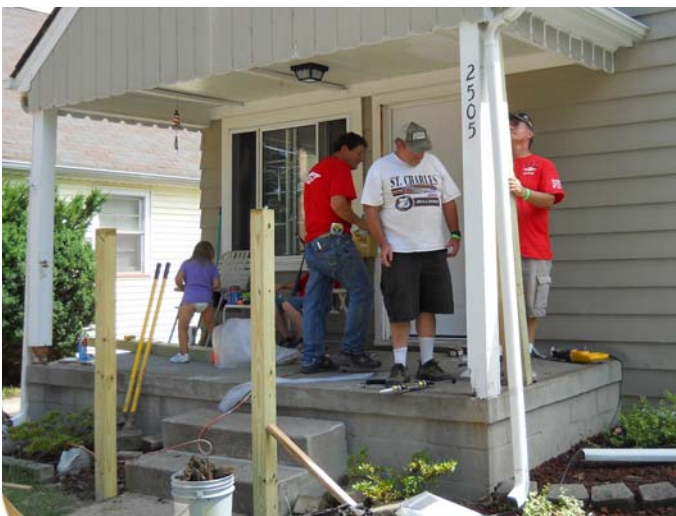
St. John Vianney worked on two houses. They replaced windows, doors, steps, insulated attics & more!