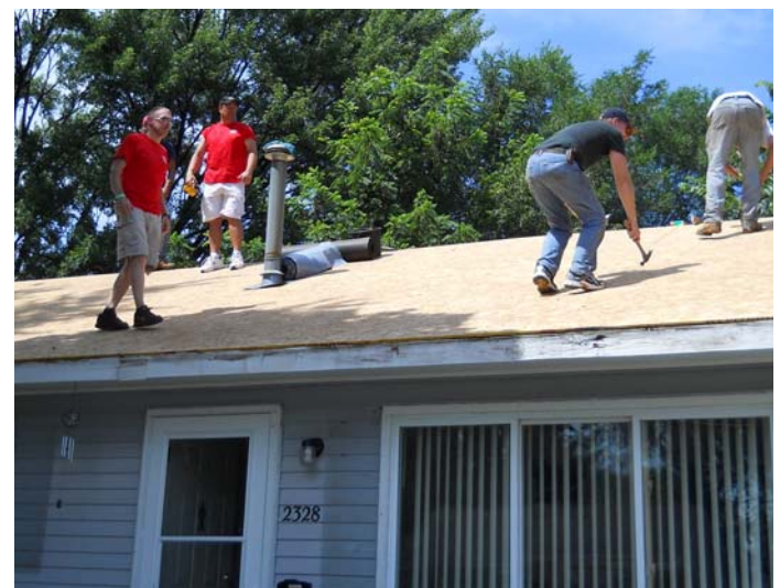
Friend of the Court and community volunteers tear off and replace a roof.