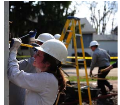
Young Professionals Network volunteers for deconstruction

This spring we were blessed with many houses to deconstruct. Our first opportunity came from Hemlock Semiconductor. They invited us to “skim” 3 houses they planned on demolishing. From these houses we acquired many valuable building materials: aluminum and vinyl siding, windows, interior and exterior doors, wood trim, cabinets, bathroom fixtures, light fixtures, furnace, shed, and much more. In addition, we were doubly blessed by being able to skim several houses with permission from Covenant HealthCare. All the items gleaned from these projects are now being sold or recycled through our ReStore to support our ministry.