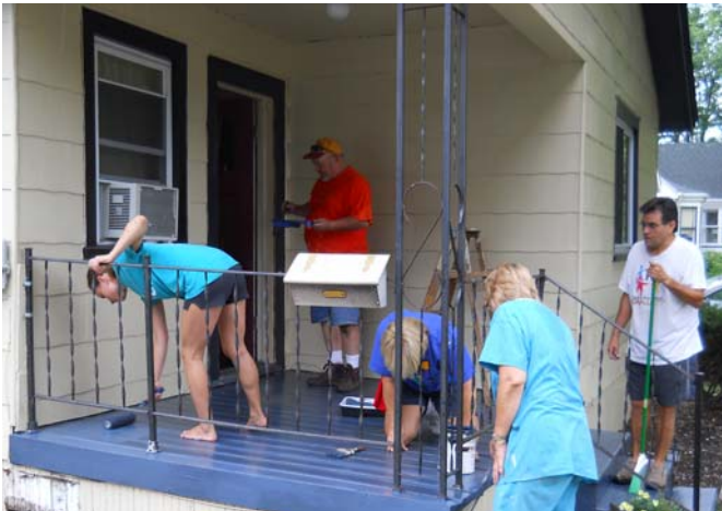
Good Shepherd Lutheran painted every night from 6:00 to 9:00 p.m. That's dedication!