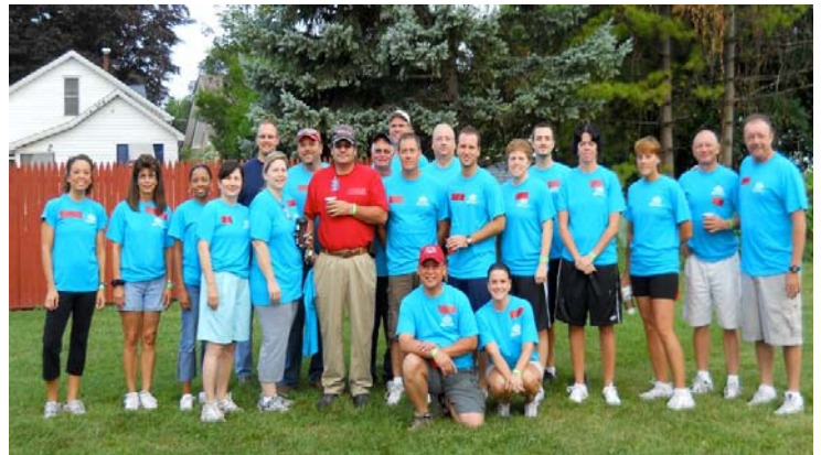
Dow Corning volunteers came in groups throughout the week to support revitalization in Saginaw, Bay City, and Midland.