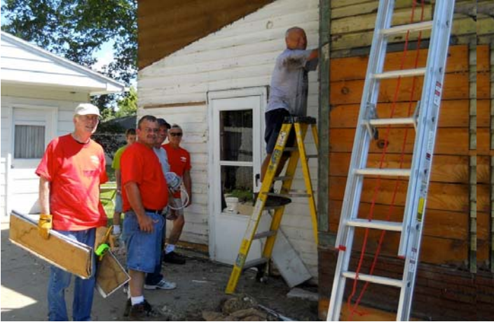
Ss. Peter & Paul members installed siding, windows, doors, steps and insulation. Great job!

For hundreds more, go to www.saginawhabitat.org