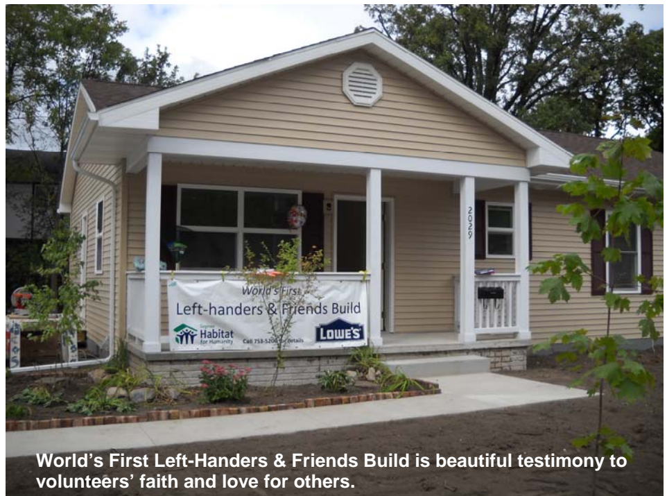
World's First Left-Handers & Friends Build is beautiful testimony to volunteers' faith and love for others.

▶ Our ReStore is entering its 7 th year of operation taking in gently used construction materials and household items and recycling them back into the community. In those seven years it is estimated that we have kept 1.4 million pounds of materials out of landfills . Thousands of individuals have donated tax deductible items, saved on disposal fees, and made construction and household items available and affordable to individuals at well below retail prices. All proceeds from sales at the ReStore benefit Saginaw Habitat for Humanity and its mission of eliminating poverty housing. **Note from a satisfied ReStore donor: "The team did a great job this morning! They were quick, efficient, professional, and polite. I was very impressed. Thanks again for the help! I'm praying that the cabinets will sell well for you. God's blessings,..."